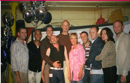
The models and speakers

In July, the Birdcage in Chiswick, played host to the launch of a new powerful campaign which highlights issues of hate crimes and homophobia within and beyond the Borough.