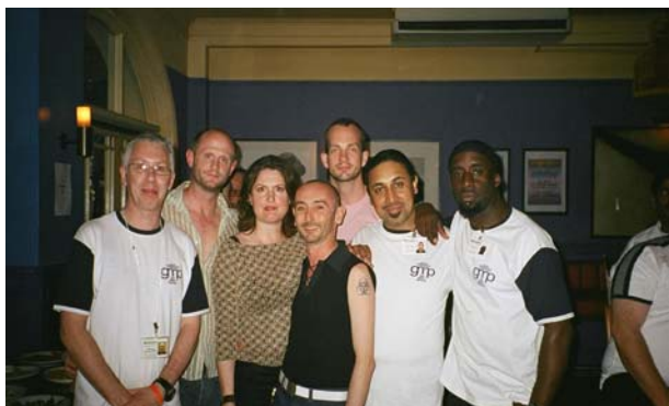
The EHH Gay Men's Project Team working that night.